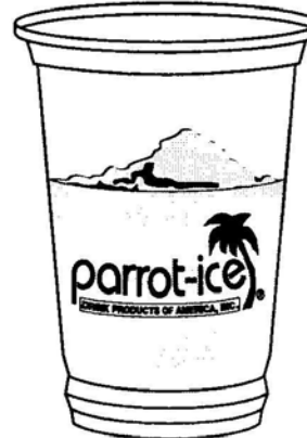
20 Ounce Serving $1.39 Suggested Retail Price