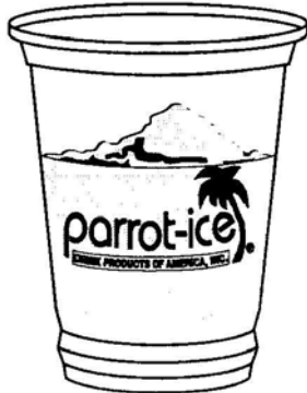
14 Ounce Serving $1.09 Suggested Retail Price