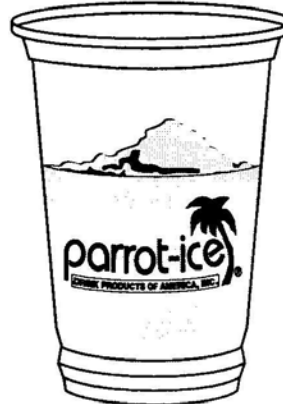
20 Ounce Serving $1.39 Suggested Retail Price