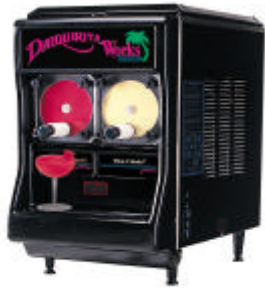
Frozen Beverage Dispenser 2403DW